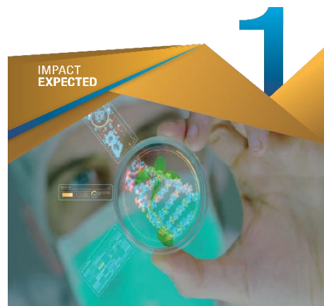
SenseUp Technology Finding a needle in a haystack

IMSE structures are 50-75% lighter and take up 25% less space than conventional electronic assemblies.