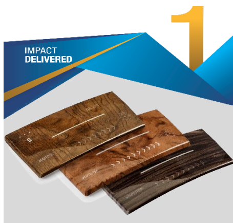
IMSE Technology Surfaces come to life

The EARTO Innovation Awards 2018 were given tonight to EARTO members VTT and Helmholtz during a ceremony held at the BELVue Museum in Brussels. VTT received the award in the Impact Delivered category for the development of the IMSE technology , which transforms injection-molded plastics into smart structures encapsulating sophisticated electronic functionality while being light, thin and durable. Helmholtz received the award in the Impact Expected category for the development of the SenseUp technology , which makes it possible to quickly and efficiently identify highly productive microorganisms capable of producing the basic building blocks for products made from renewable raw materials.