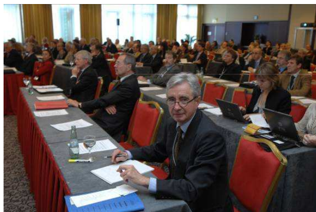
Some of the almost 200 participants gathered for the principal plenary session of the EARTO 2007 annual conference